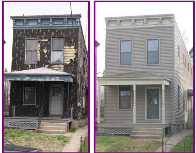
3066 Henshaw – Before and After