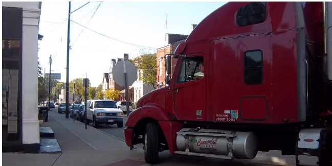
A BIG RIG FROM GEORGIA HITS A STOP SIGN AT RACHEL AND SIDNEY. OUT-OF-STATE DISPATCHERS SEND OVERSIZED SEMIS THRU UNDERSIZED RESIDENTIAL STREETS.

Neighbors on Henshaw complain of big rigs and local trucks speeding when they enter from Hopple Street. The Community Council would like a truck ban on these side streets. Using Colerain to Township is an acceptable alternative.