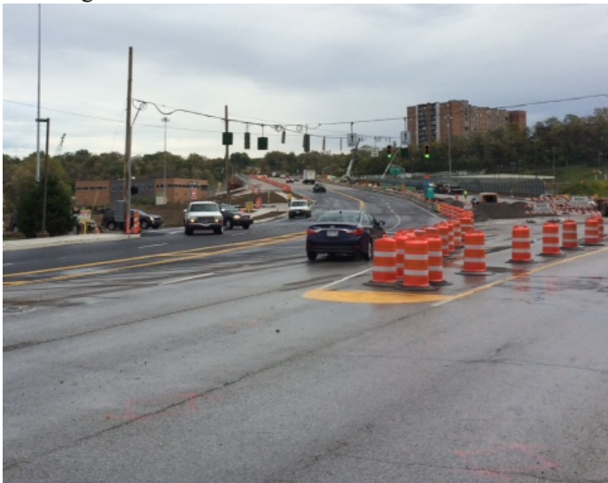
Hopple Bridge looking east.

The Camp Washington Community Council remains unconvinced, however, of the Noise Wall process. Currently, ODOT requires land owners along the possible site to have a direct vote. Suburbanites who own their own homes often vote for noise walls, as their homes abut up against the expressway; in the City neighborhoods, you rarely see noise walls because many absentee land owners refuse to engage in the process. The southern part of Massachusetts will not have a noise wall because one land owner of five parcels voted against it. The community council would like to be the forum to vote for or against noise walls.