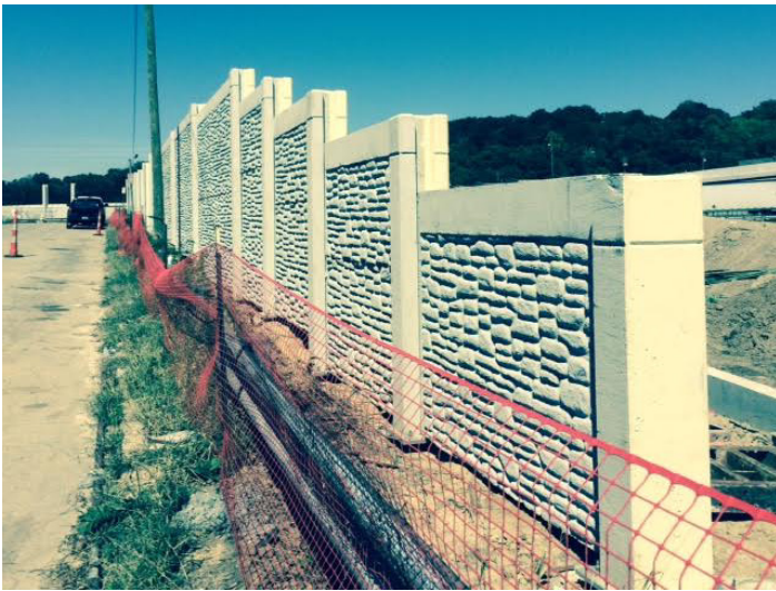
This is Camp Washington's new Noise Wall along Massachusetts (North of Hopple).