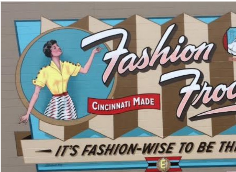
This is one of four new murals installed during the Letterheads convention held at ASM in late September.

Healthy Moms & Babies - Medical van coming to Camp Washington Monday, Oct. 12 and Oct.26 between 9:30 a.m. - 3:30 p.m. Info: 591-5600 Pregnancy, STD tests, doctor referrals, screenings