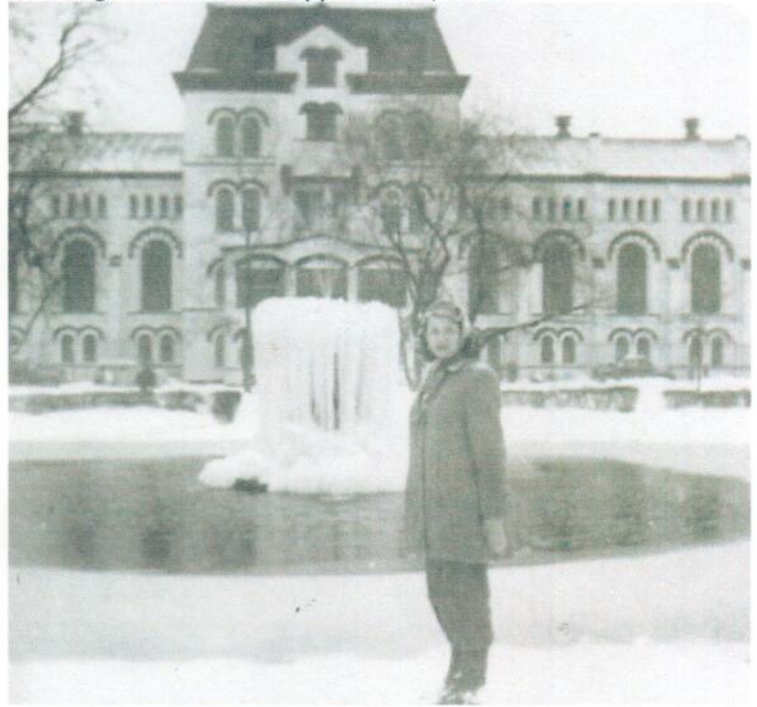
The Workhouse, at Valley Park, winter 1950.